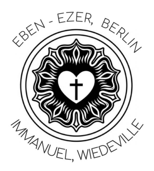
Lutheran Churches in Washington County, Texas