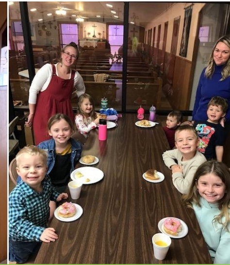
Ringing the bell and enjoying donuts in Warrenton