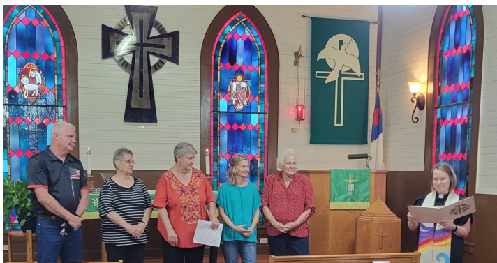
Ellinger Council Installation